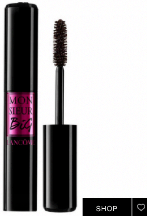
Lancôme Monsieur Big Mascara ($27)

(Ed. note: 1944 Paris isn't available in the U.S., so we recommend the palette above for a similar effect.)