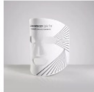
CURRENTBODY SKIN LED Light Therapy Mask ($380)