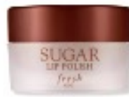
FRESH BEAUTY Sugar Lip Polish ($18)