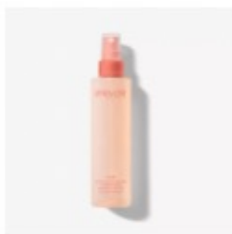
PAYOT PARIS Gentle Toning Mist for Face and Eyes ($23)