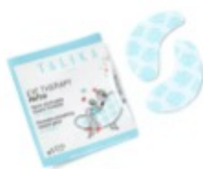
TALIKA PARIS Eye Therapy Patch Solo ($11)