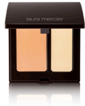
LAURA MERCIER Secret Camouflage