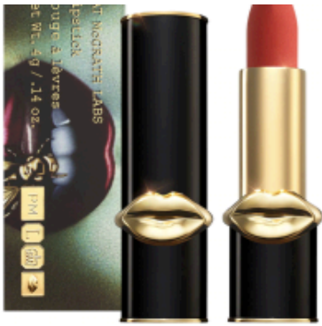
PAT MCGRATH MatteTrance™ Lipstick