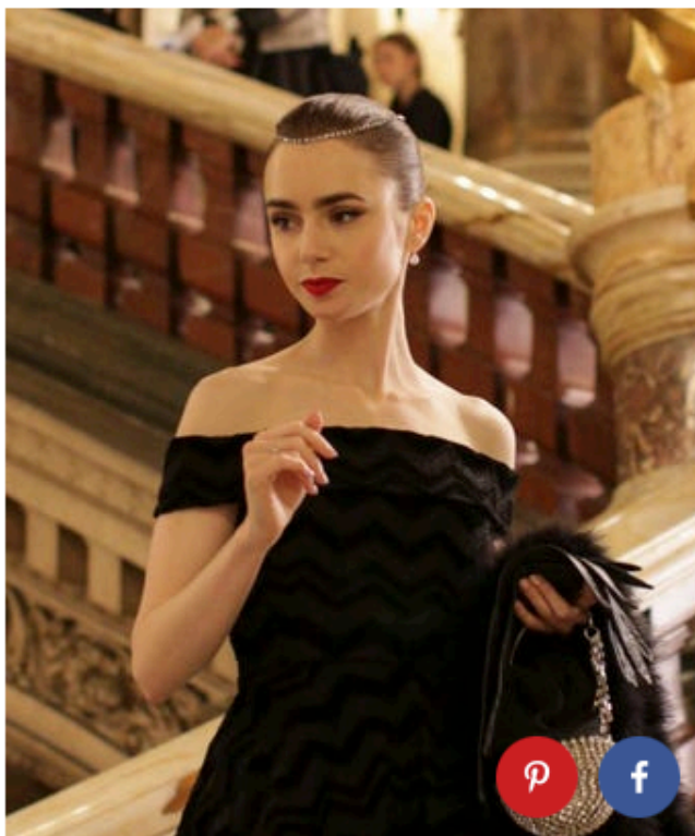
LILY COLLINS IN 'EMILY IN PARIS.'

Imagine if Carrie Bradshaw went to Paris and, instead of being snubbed by her boyfriend's snobby friends, losing her beloved name-plate necklace, and getting slapped , she dumped the loser, went to the ballet solo, and spent weeks gallivanting the city in bucket hats and black tulle — leaving a trail of hot French men in her wake. That's roughly the premise of Netflix's Emily In Paris , a fashion-stuffed, 10-episode brain-candy binge from Sex and the City creator Darren Star.