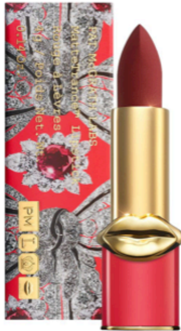
PAT McGRATH LABS MatteTrance™ Lipstick