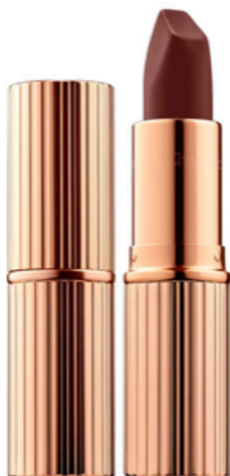
Charlotte Tilbury Matte Revolution Lipstick

Let it be known that Aurelie says eyeliner is the move for a date-night look — you know because of the possibility of some French kissing. But, she would say Emily's go-to lip for a date night out calls for Charlotte Tilbury in Bond Girl, which is now M.I.KISS. How fitting.