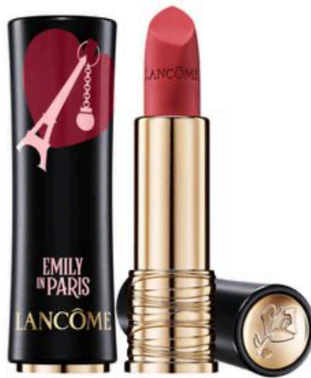
Lancôme For The Love of Paris L'Absolu Rouge Lipstick ($32)