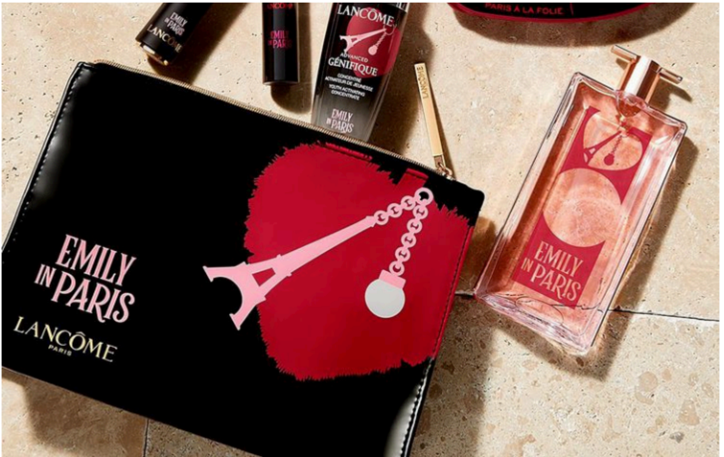
@LANCÔMEOFFICIAL // INSTAGRAM

It's easy to understand why beauty lovers everywhere continue to turn to Parisian trends for inspiration. And who can blame them? The city's signature blend of minimalistic glam and upscale cosmetic products has a certain amount of je ne sais quoi that we cannot ignore.