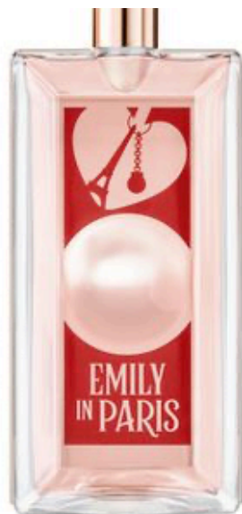
Lancôme For The Love of Paris Idôle Eau de Parfum ($99)