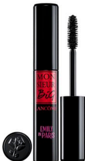
Lancôme For The Love of Paris Monsieur Big Mascara ($26)